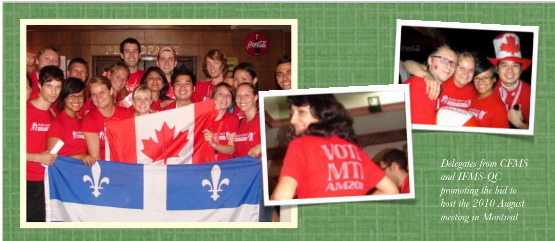
Delegates from CFMS and IFMS-QC promoting the bid to host the 2010 August meeting in Montreal